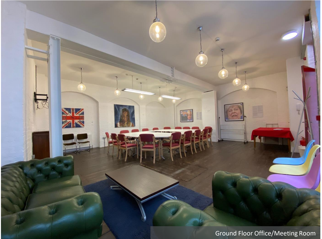
Ground Floor Office/Meeting Room

This self-contained property is set back from Endell Street and accessed via a gated pedestrianised walkway. The property is arranged over a Basement, Ground, First, Second and Third floors. This industrial warehouse style building benefits from good natural light with sanded/varnished wooden floors.