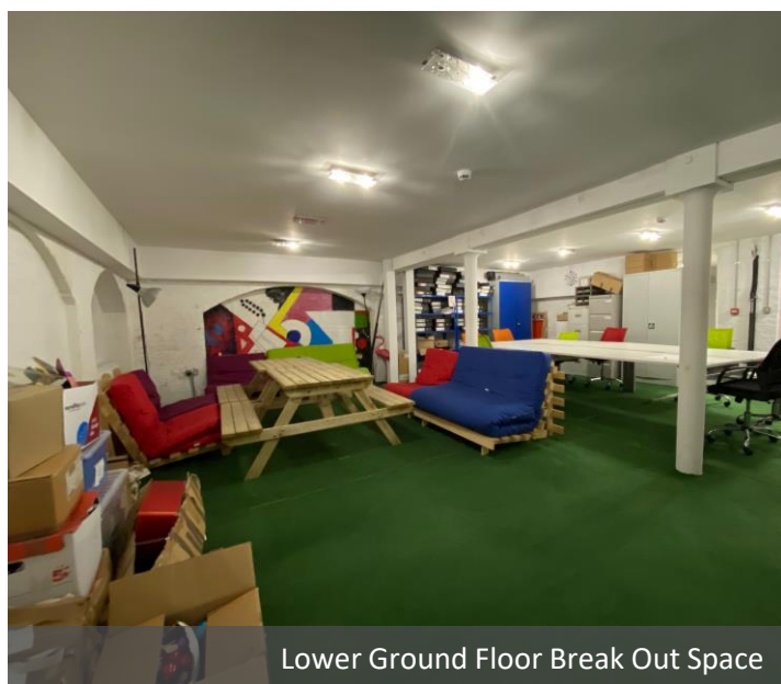
Lower Ground Floor Break Out Space